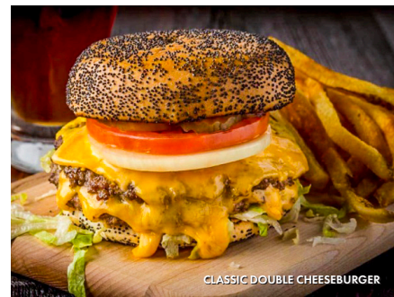
CLASSIC DOUBLE CHEESEBURGER