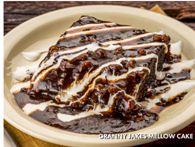
GRANNY JAKES MELLOW CAKE