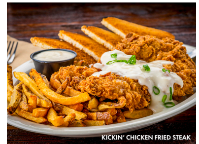
KICKIN' CHICKEN FRIED STEAK

Three spicy hand-breaded chicken tenders with gravy. Served with grilled Texas Toast and Jakes hand-cut fries.