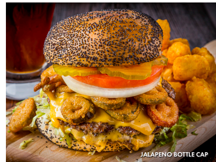
JALAPENO BOTTLE CAP