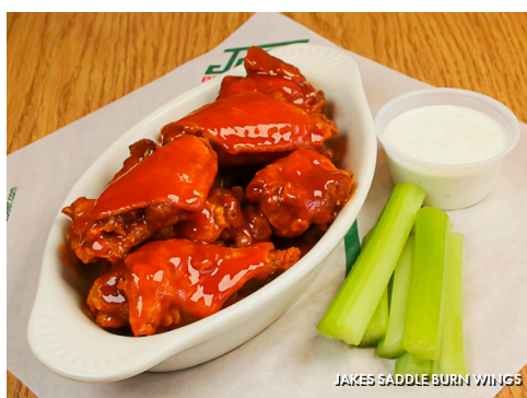
JAKES SADDLE BURN WINGS