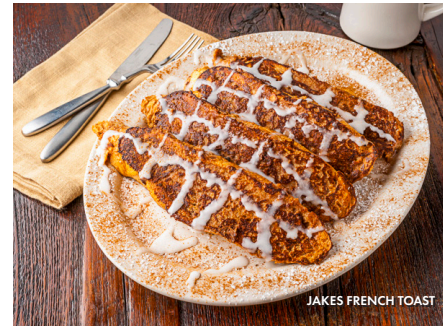
JAKES FRENCH TOAST