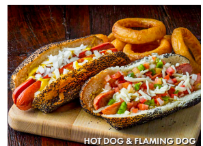
HOT DOG & FLAMING DOG