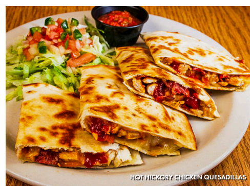
HOT HICKORY CHICKEN QUESADILLAS