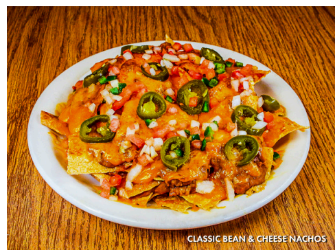
CLASSIC BEAN & CHEESE NACHOS