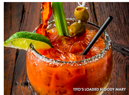
TITO'S LOADED BLOODY MARY

*Consuming raw or undercooked meats, poultry, shellfish, or eggs may increase your risk of foodborne illness.