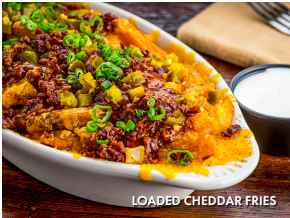
LOADED CHEDDAR FRIES