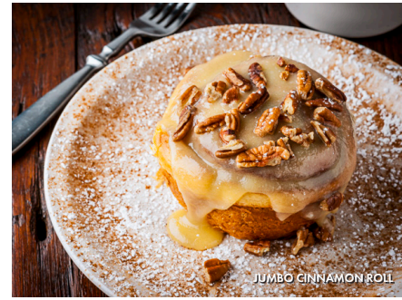
JUMBO CINNAMON ROLL